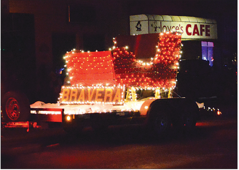
Bravera Bank urges customers to forge their path with Bravera.