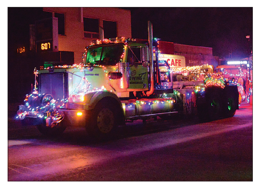
A+ Towing and Recover of Stanley wished everyone a very Merry Christmas.