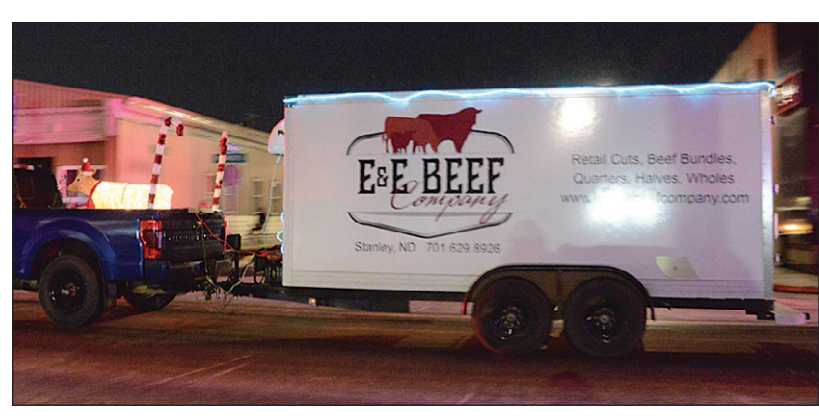
Merry Christmas from E&E Beef Company.