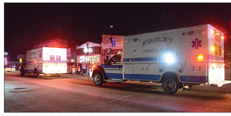
Stanley Ambulance Service had two units in the parade.