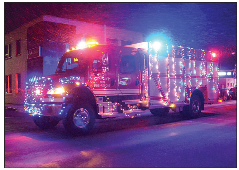
Stanley Fire Department had one unit in the parade.