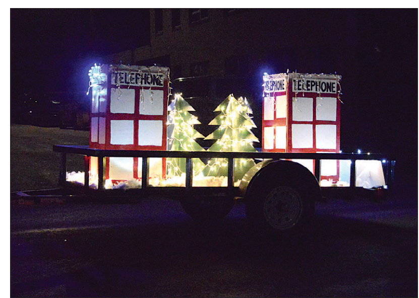
RTC\ Networks\ provide\ internet,\ voice\ and\ TV\ as\ your\ technology\ leader.