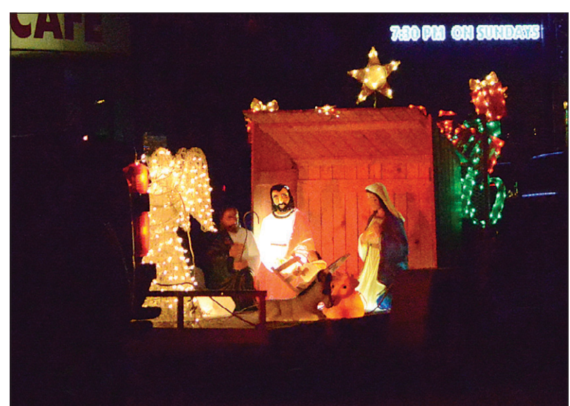
The Prairie Ford float wished everyone a Merry Christmas and successful New Year.