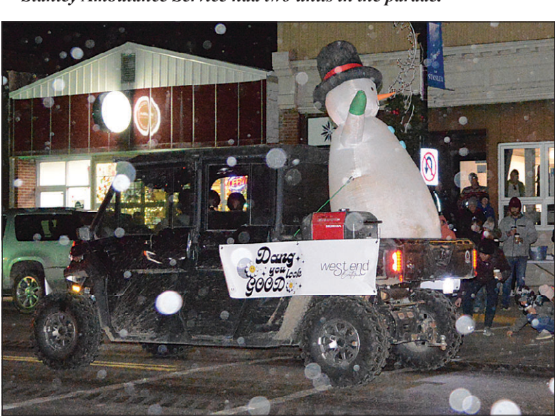
West End Boutique wished everyone a Merry Christmas.