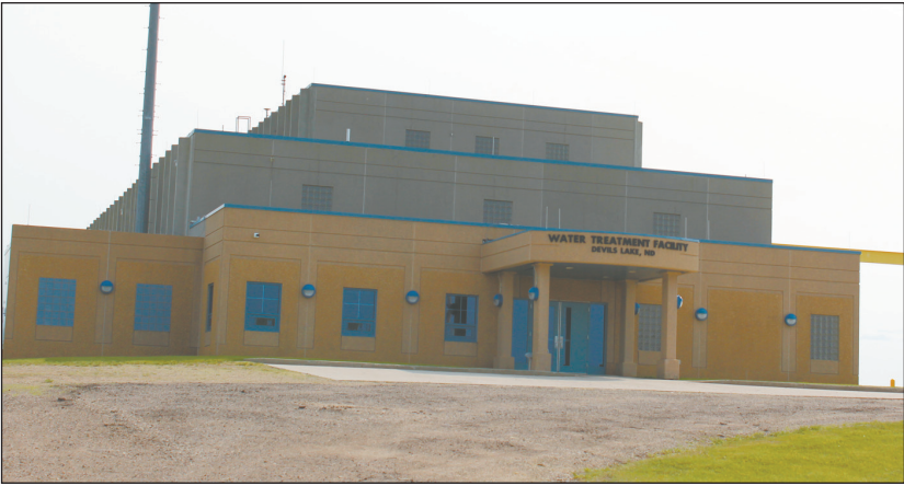
The Devils Lake Water Treatment Plant is located south of Mac's Hardware Store, beyond the Community Gardens.