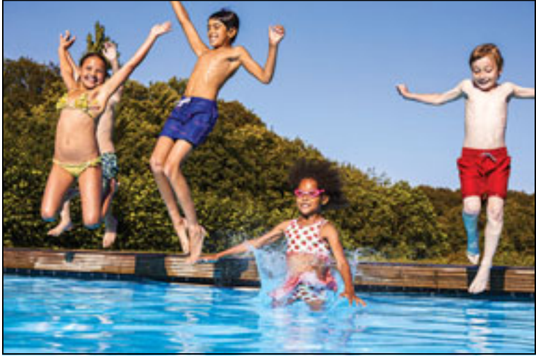
Having a list of activities at the ready can help families stay active and engaged during the dog days of summer.

Families have plenty of ways to fill the dog days (and nights) of summer with entertaining games and other activities.