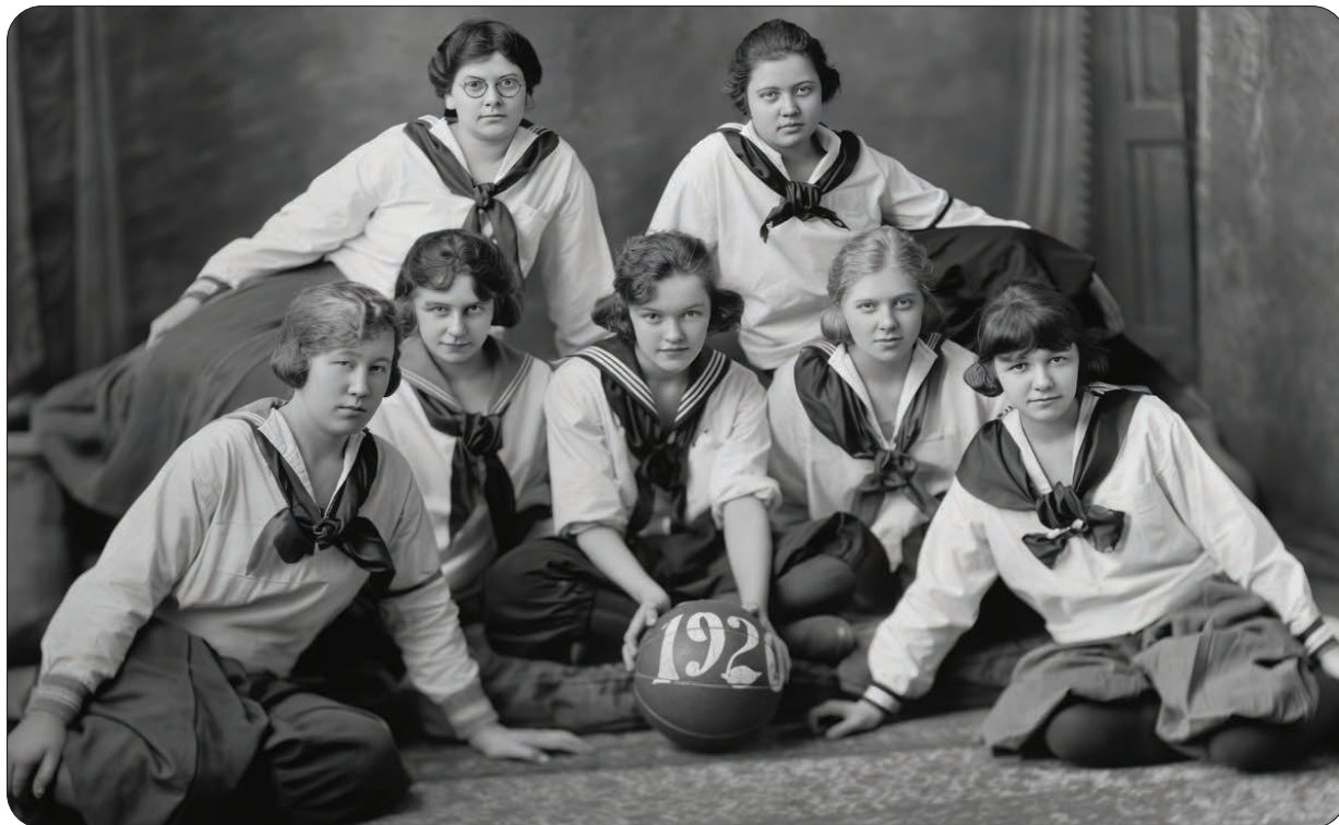
The 1920-21 EHS girls basketball team appears on a two-page spread in the first EHS bound yearbook, the 1921 Maroon and Black , pages 66 and 67. That yearbook can be browsed or downloaded at bit.ly/EHS1921 .

The page records that the team had five wins and two losses, with especially strong performances in