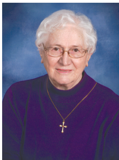
March 11, 1926 — May 26, 2026