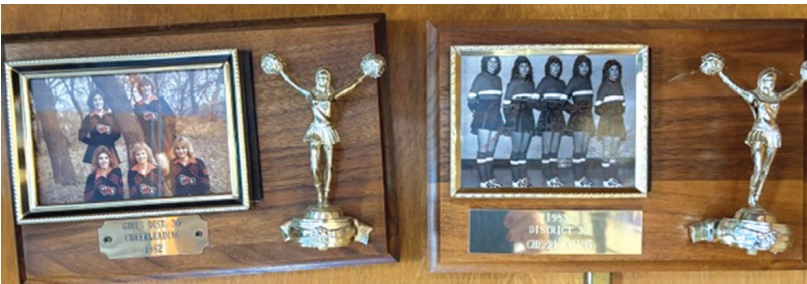
There are many like the above cheerleading and spirit awards in the trophy case at Glen Ullin Public School. The cheerleaders were a very important part of the school.