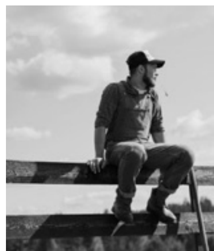
Addressing the wellness needs of those working in agriculture or related areas will be the focus of the upcoming "Question. Persuade. Refer." suicide prevention webinars.