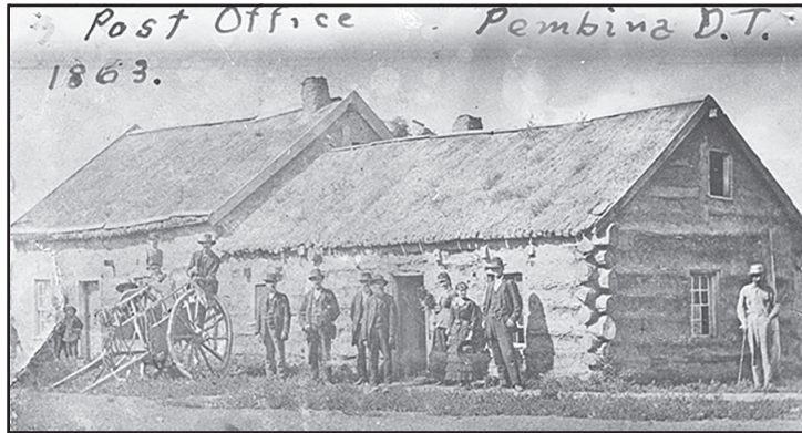
ND's first post office, Pembina, ca. 1863.

Over time, economic industry shifted from fur trading to a more agrarian society. During the Great Dakota Boom of the late 19th century, thousands of newcomers arrived to establish farms and businesses. Railroads connected communities and