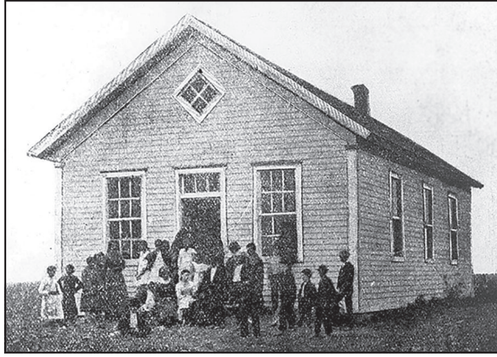
ND's first schoolhouse, Pembina, ca. 1876.