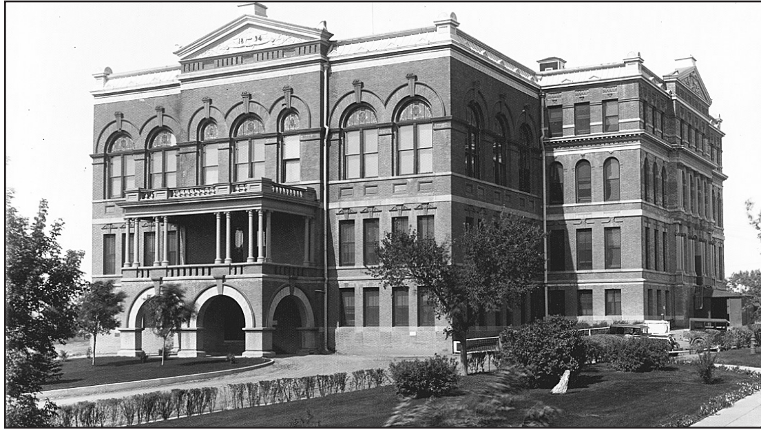
Bank of North Dakota

These systems built the foundation for a resilient