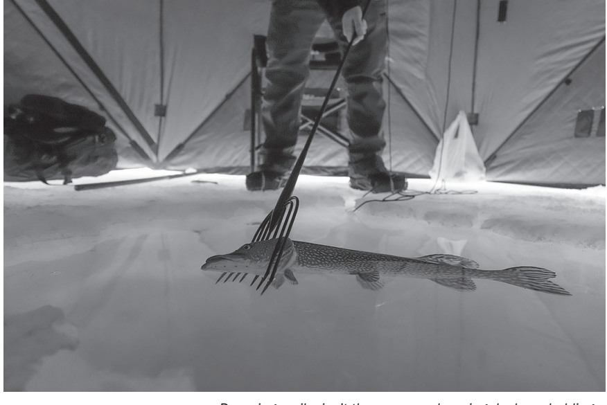
Decoying a pike isn't the same as decoying ducks or holding a draw on a deer.

Looking at last year's spearfishing statistics prove how a warmer winter with poor ice conditions results in lower participation and success.