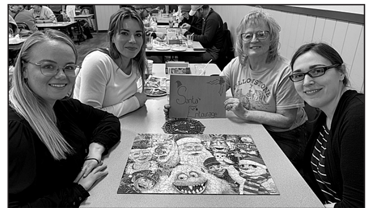
4th Place - Santa's Entourage