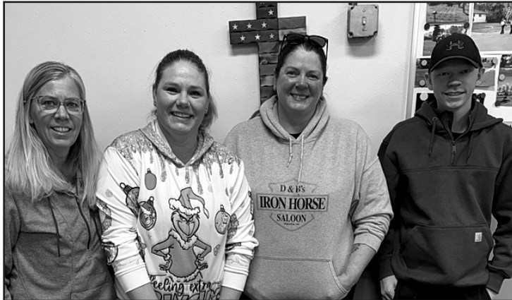
2nd Place - The Grinches Steal the Win