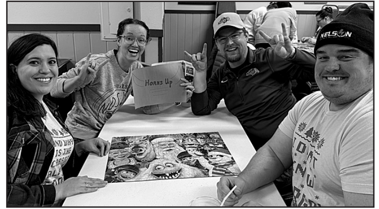
3rd Place - Horns Up