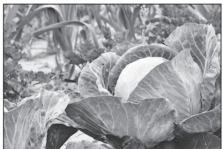
This series is about growing, preserving and preparing specialty-crop fruits and vegetables.

Julie Garden-Robinson, NDSU Extension food and nutrition specialist, says that when the first Field to Fork webinar series started 10 years ago, online webinars were still relatively new. "People were not routinely participating in online webinars," says Garden-Robinson. "We needed to