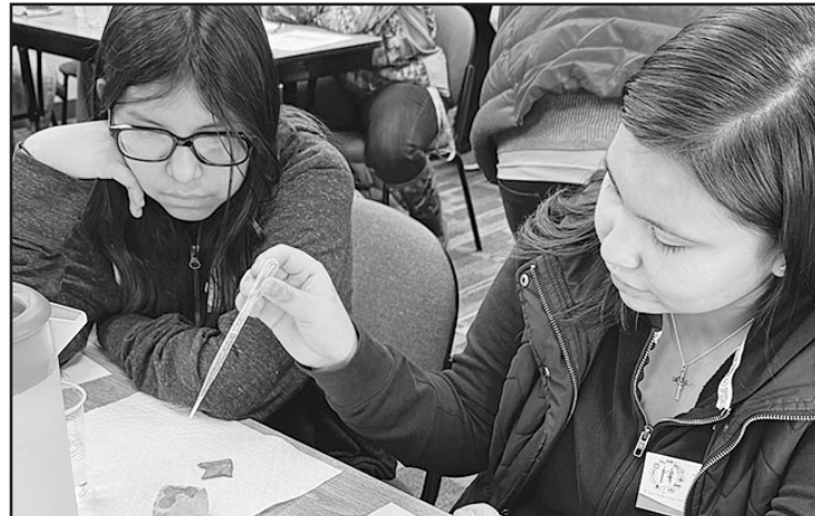
7th and 8th graders learn about porosity and permeability.