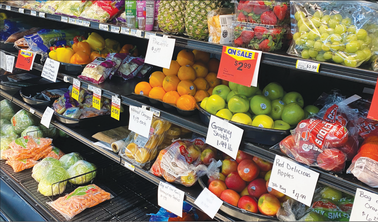
Seven or eight stores in the region have shown an interest in starting discussions about developing a grocery distribution cooperative to cut costs and better manage inventory.

Oct. 16, 2025 $1.50 Vol. 33 No. 42 herald@gspublishing.net | www.gspublishing.net