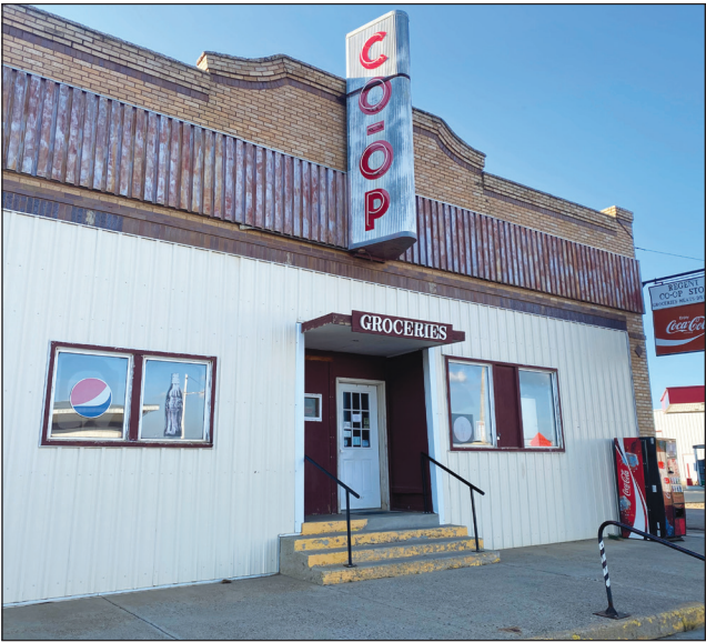
The Regent Co-op Store is exploring areas to save money and cut costs.