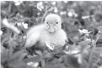
Whether it's a fawn, baby bird, rabbit, or duckling, the key to handling these situations is restraint.

North Border: Walhalla – Caylee Berg- NDSCS