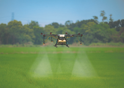
AGRICULTURE: Proposals sought for drone detection of noxious weeds PG. 4