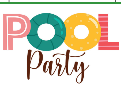
OPINION: Drayton's Riverfest Pool Party details PG. 5