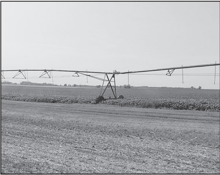
Winter snowstorms and prolonged downtime may have caused some damage to an irrigation system, so it's important to inspect.

The operational vibrations during the growing season and freeze-thaw cycles during winter and spring can loosen bolts, nuts or screws, especially on electrical components or wire