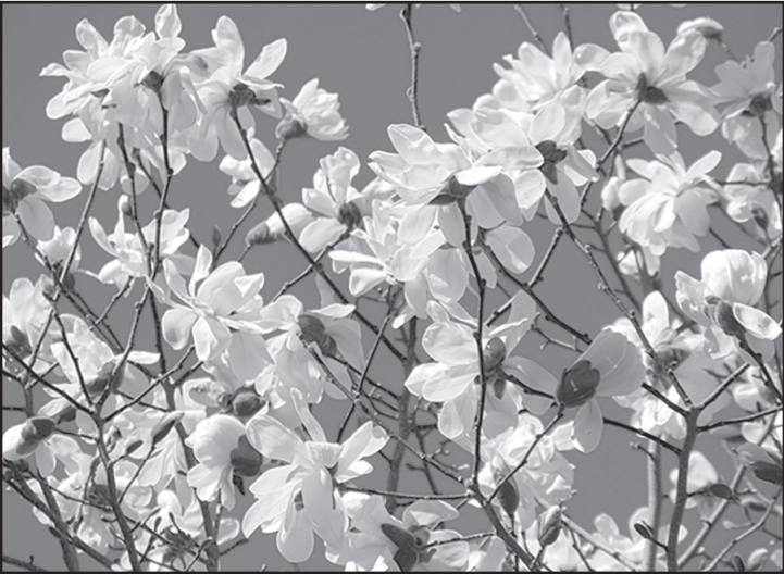
Developed by NDSU, the Spring Welcome® magnolia tree is beautiful and has proven to be winter-hardy for the Dakotas.

Registration is required. Call 1-800-272-3900 or visit www.communityresourcefinder.org .