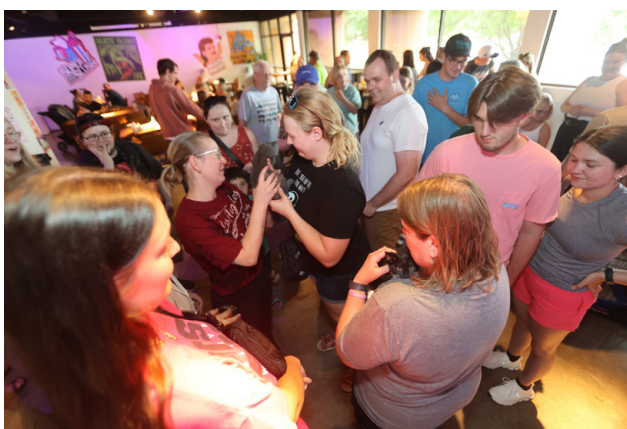
Patrons hold kittens at Homeward Animal Shelter's Cuddle a Kitten! on Thursday at Junkyard Brewing Co. in West Fargo.

Her team often partners with nonprofits to bring a good cause home, she said, like the