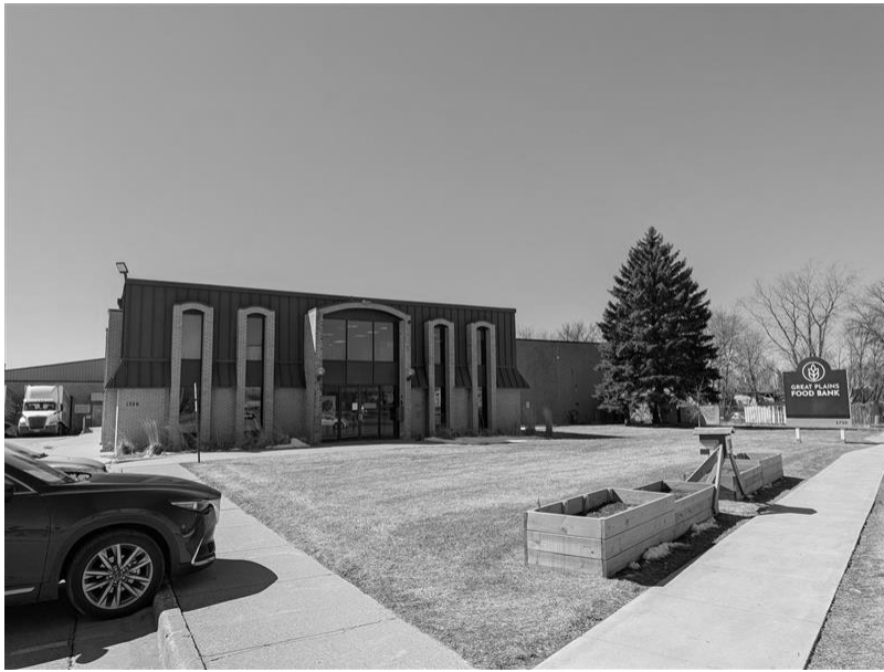
North Dakota's only food bank has been serving the state for over 40 years. However, the current distribution center is facing structural and capacity issues. House Bill 1143 would give $10 million to the organization to build a new distribution center in Fargo.