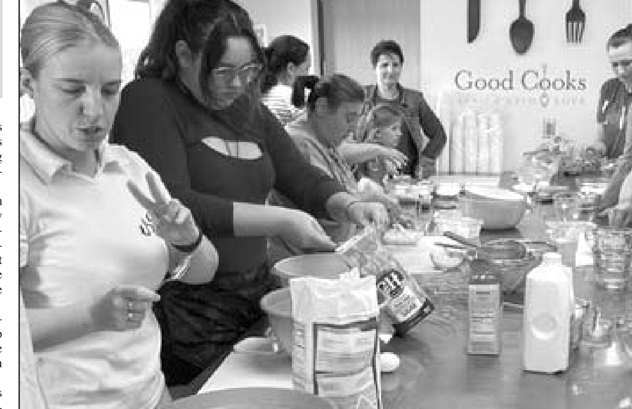
Several Ukrainian parolees and members of the Legacy Church community in Bismack at an event share tips on cooking American and Ukrainian dishes

Gross said people often don't see the post-war reconstruction part of the picture when thinking about hu-