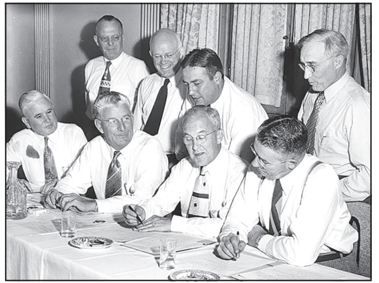
A North Dakota civic meeting, illustrating the long tradition of local governance and community decision-making via ND League of Cities.

Organizations like the ND League of Cities have supported this work for more than a century. Founded in 1912, the League provides resources, training and advocacy to help cities navigate complex challenges, from infrastructure planning