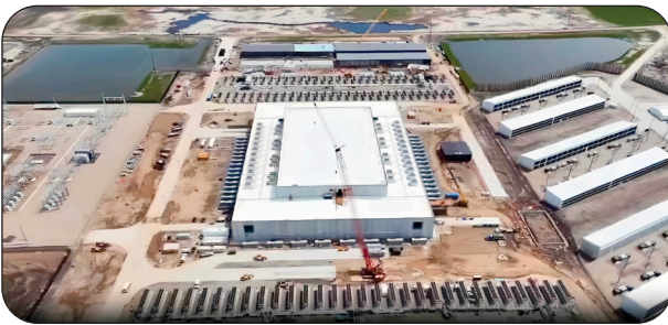
Applied Digital announced a 15 year multibillion dollar contract with Coreweave, a major hyperscaler company.