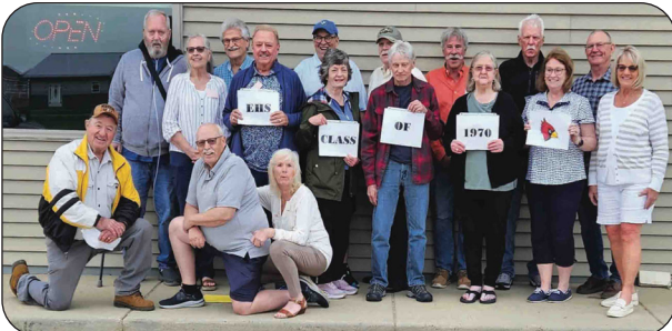
Members of the class of 1970, largest ever EHS graduating class, still loyal Cardinals after all these years.