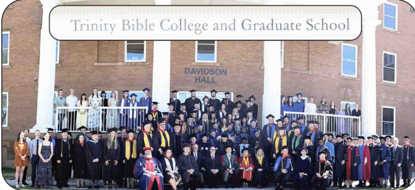
Trinity Bible College & Graduate School presented Ph.D. diplomas to eight students.