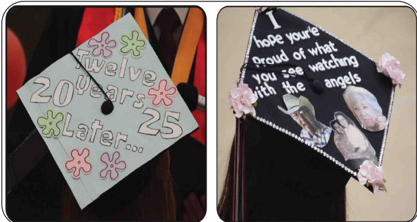
Several EHS grads wore heartfelt messages on top of their mortarboards.