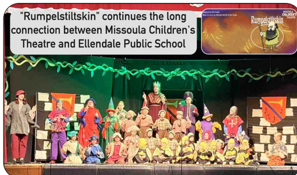
Once again, the Children's Theatre performance was a highlight of the end of a school year.