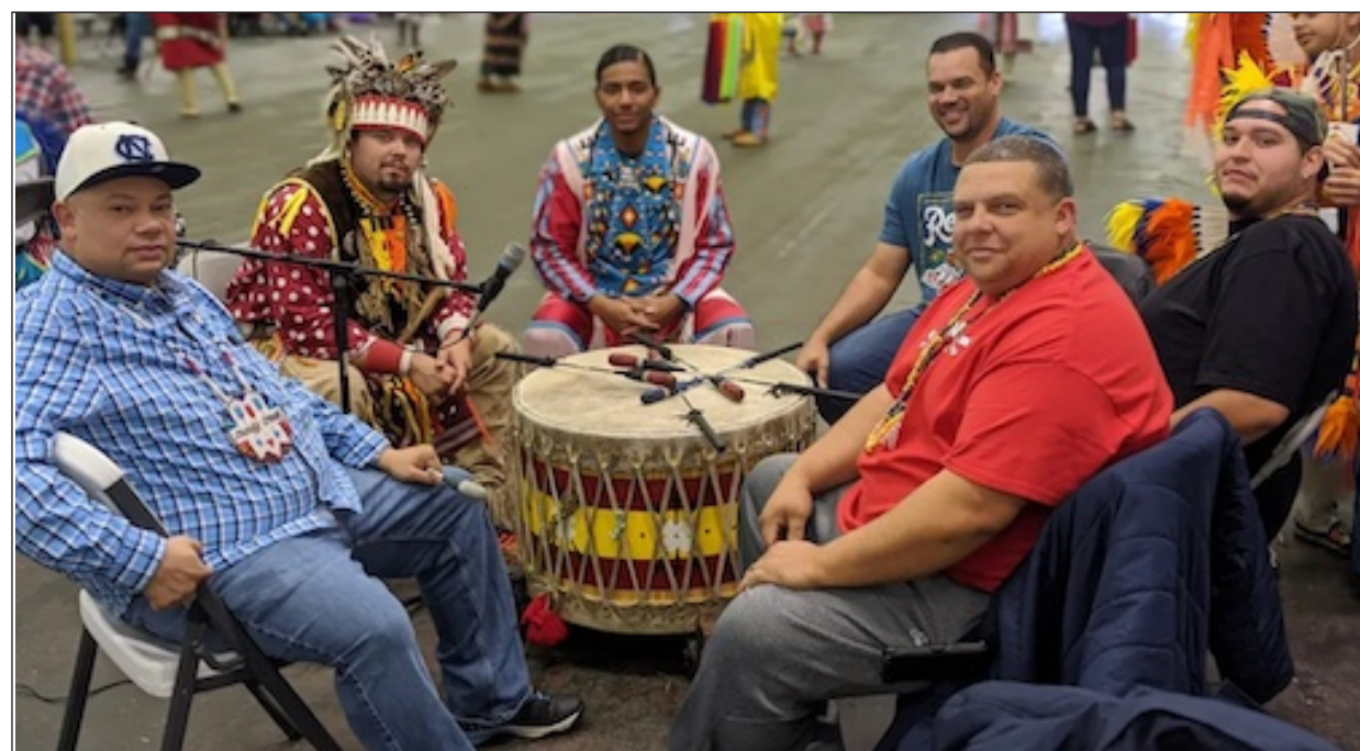
The Stony Creek drum group at the Richmond powwow.

While there are many similarities between the two drum styles; there are also subtle, important differences. Drums represent their tribes, regions and histories. Attending a powwow will allow an individual to see the diversity in