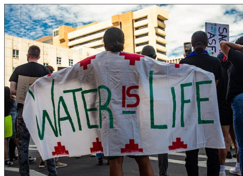
Protestors gather in response to the "Building an Advanced Energy Ecosystem in New Mexico" summit in downtown Albuquerque on Sept. 14, 2023.

Through the event, organizers hope to raise funds to support tribes whose grants were pulled. Two Bears said Indigenized Energy was supposed to be