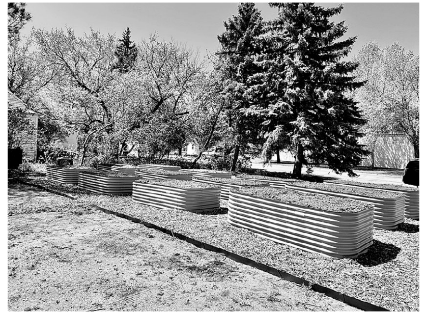
Raised beds ready for planting at the Towner Community Garden. If selected for a grant as part of the Rural Health Transformation Program, the garden could double the number of beds and other improvements.