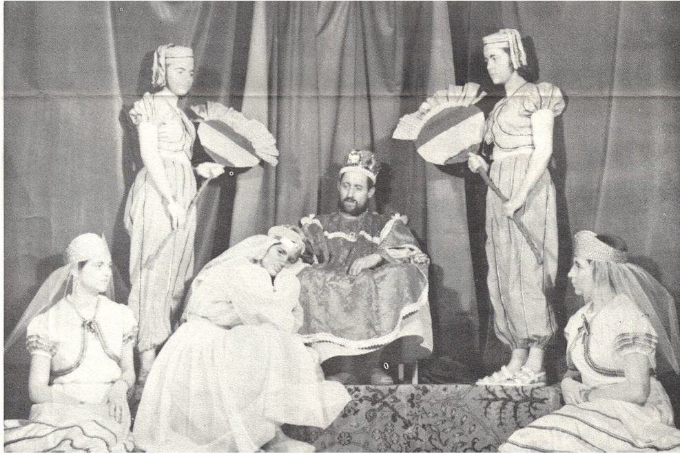
Picture from the past of the Passion Play. King Herod's Court.

The Glen Ullin Times will continue to print The Glen Ullin Passion Play program each week to its end.