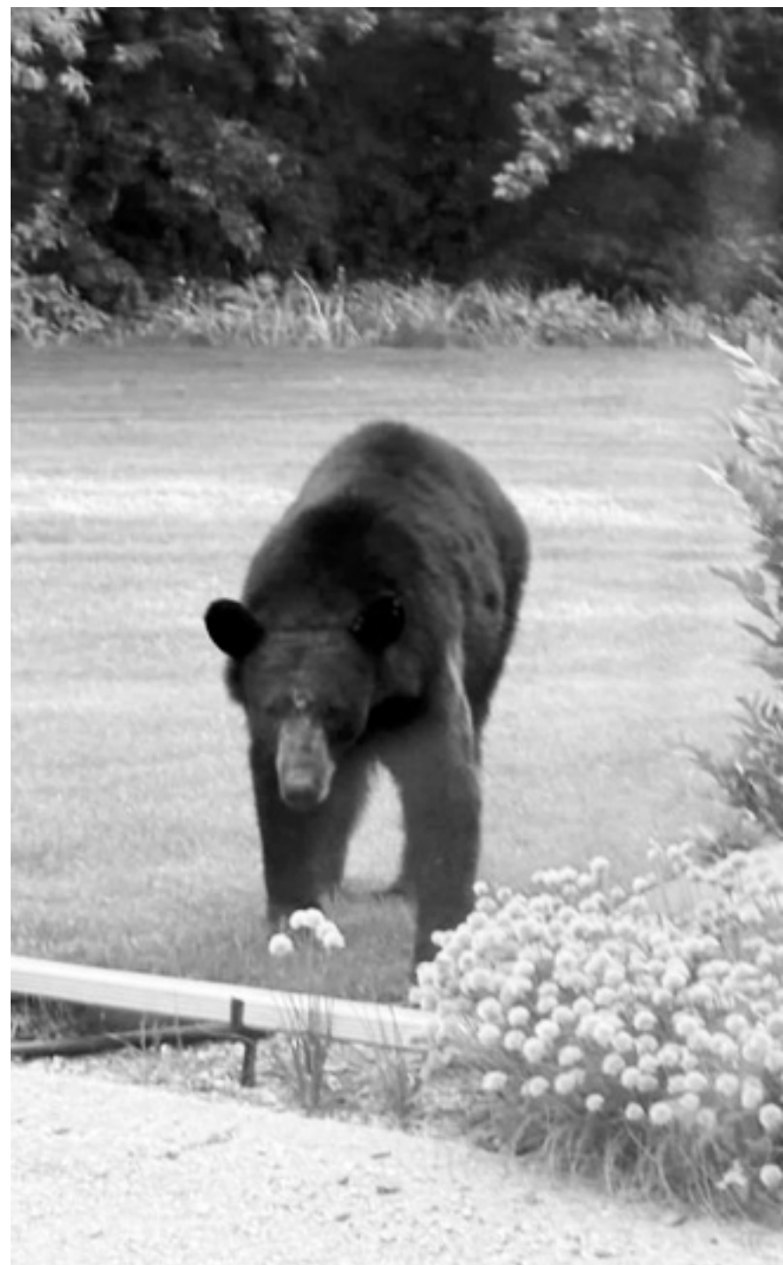
A black bear strolls through a residential yard in Osnabrock on June 9. Residents reported multiple sightings of the bear as it wandered through the community before moving on.