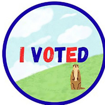
Greenfield's "I Voted" Submission

the circle below the submission of your choice. You will be prompted to fill in your email address and which county you live in. It takes just a couple of minutes and might make a locally created gopher and its artist's day.